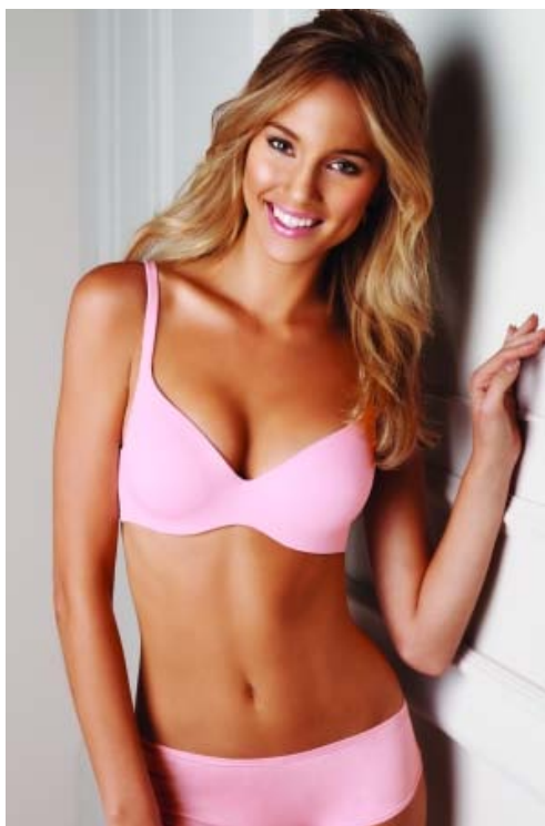
Bras N Things: 200 stores across Australia and New Zealand.

Other retail brands in BB Retail's portfolio include accessory chains Diva and Lovisa.